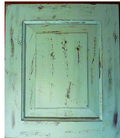
45FR - Rain Cloud French Rub

Please call Customer Service if interested in wood finish blocks