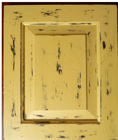
43FR - Bee's Wax French Rub