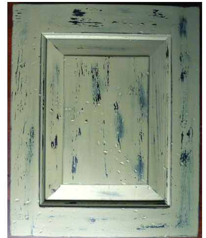
36FR - Bayleaf French Rub