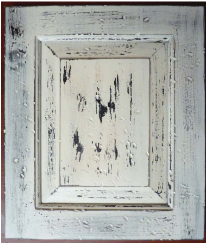
16FR -Cottage White French Rub

EACH PIECE IS SLIGHTLY DIFFERENT FROM THE NEXT DUE TO THE ARTISTIC NATURE OF THE FINISH.