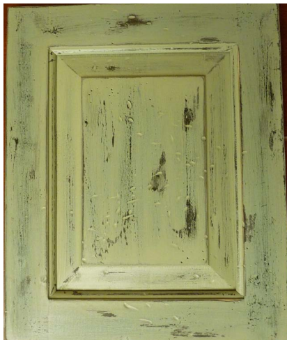
34FR - Cactus French Rub