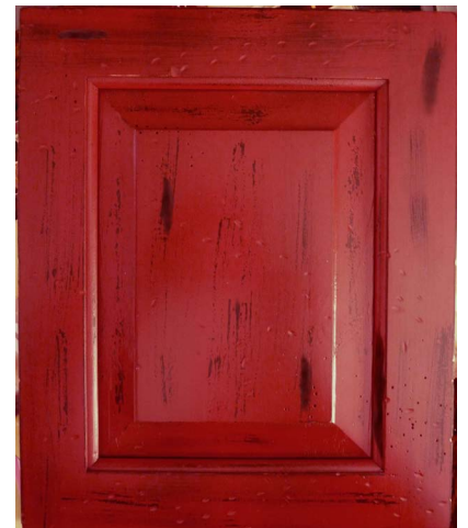
18FR -Brick Red French Rub