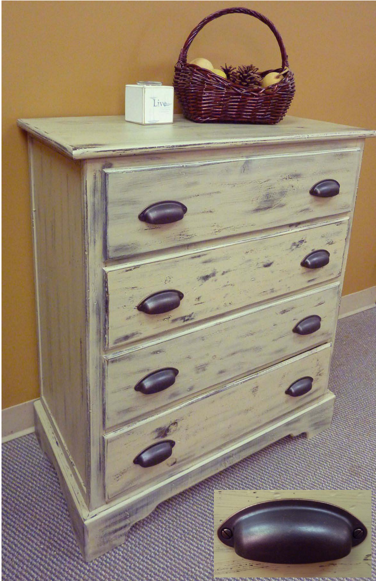
3640 Madison 4 drw Chest, shown in 37FR - Sandstone French Rub Finish with New Pewter Finish Cup Pulls (PWCUP)